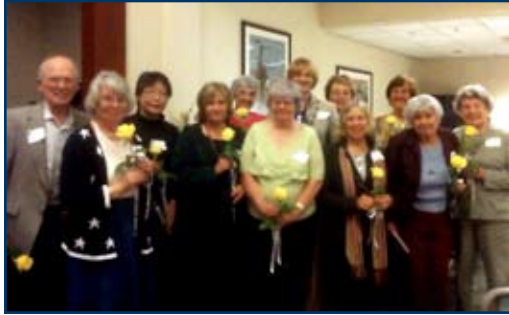
Current board members acknowledged for service

This yearly meeting, like all its predecessors, gave members a chance to see old friends. It was attended by 45 members and guests. In addition, several new members were in