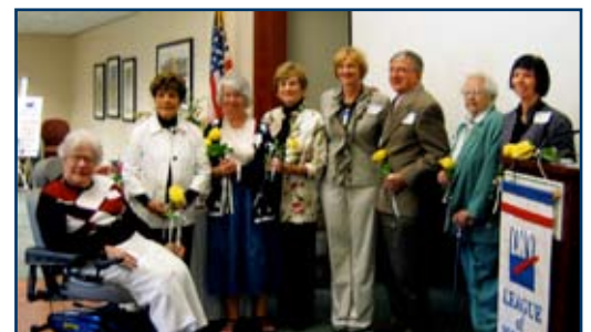
Off-board service recognition